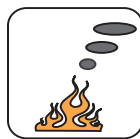
Low Smoke Emission IEC 61034-2 / EN 50268-2 NF C32-073/NF C 20-902