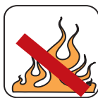
Flame Retardant NF C32-070-2.1(C2) IEC60332-1-2/EN50265-2-1